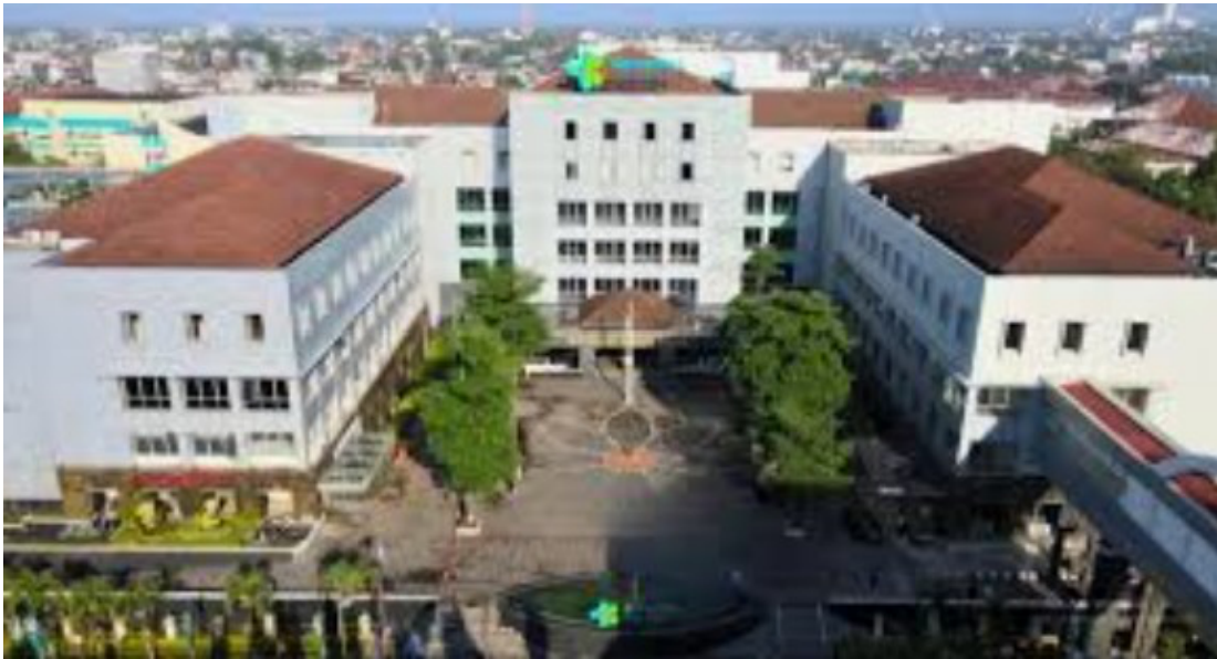
Figure 1. This is Hospital Building RSUP Dr. Sardjito

The hospital's photograph is available via the following internet link: https://share.google/wjrSDmbpCHoRGOHmv